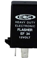
New Style (Small Case) Running Change

New Style Small Case Design As A Running Change Heavy Duty Electronic Flasher 3-Pin, 2-6 Lamps, 162W Max., DOT